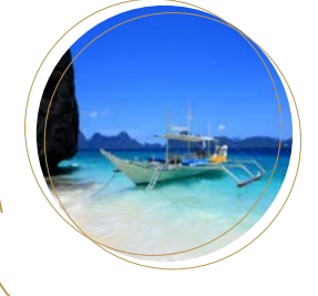
BEACH HOPPING The island of Boracay is bounded by multiple white sand beaches and coves.